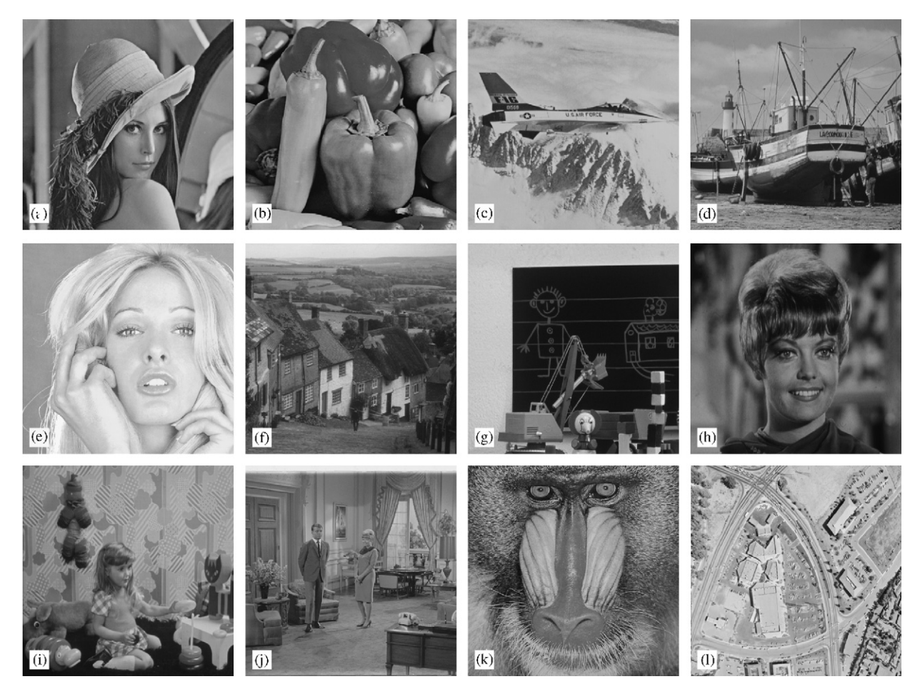
Fig. 1. The images used in this study: (a) 'Lena', (b) 'Pepper', (c) 'F-16', (d) 'Sailboat', (e) 'Tiffany', (f) 'Goldhill', (g) 'Toys', (h) 'Zelda', (i) 'Girl', (j) 'Couple', (k) 'Baboon', and (l) 'Aerial'.

The comparisons using PSNR-based measurement were made between the algorithms as shown in Table 1. In this table, the CNN-ART-LBG algorithm is an approach combining the CNN-ART and LBG approaches. Here, the codebook was first generated from the CNN-ART algorithm, and the final codebook was refined by the LBG algorithm. Similarly, the GSAVQ algorithm is an approach using the genetic algorithm encoding and the simulated annealing technique. The proposed approach is clearly superior to the others. Next, two experiments for the codebook generality were conducted. The 'Lena' image was used to be the training image and to generate a codebook in the second experiment. The codebook was used to encode and decode the images 'Pepper', 'F-16', 'Sailboat', and 'Tiffany' as shown in Fig. 1(b)-(e). The PSNR values generated by 10 algorithms are tabulated in Table 2. Similar to the second